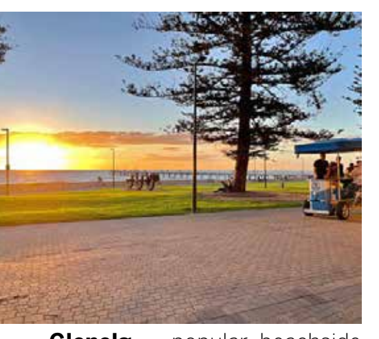
Glenelg - popular beachside suburb located on the shore of Holdfast Bay in Gulf St Vincent, located just 7kms from Ashbrook Apartments.

Ashbrook Apartments situated in the leafy Adelaide suburb of Ashford between the City & Sea, its location affords Ashbrook residents easy access to popular local destinations and attractions, with the convenience of medical assistance when needed a few steps away at neighbouring Ashford Hospital.