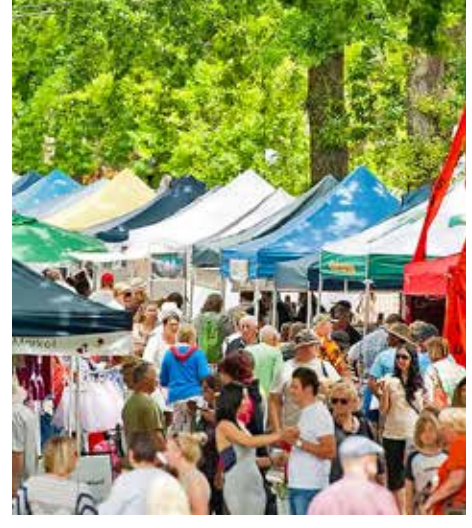
Adelaide Farmers Market -Located less than 2 kms away in the Adelaide Showgrounds open on Sunday mornings.

Adelaide Parklands Rail Terminal Interstate Passenger Railway Station -Less than 2 kms commute.