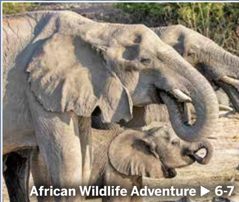
African Wildlife Adventure ▶ 6-7