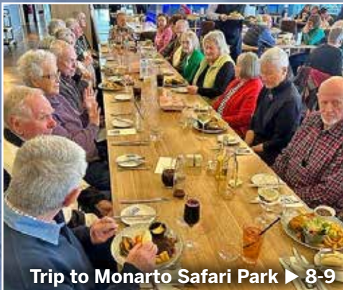
Trip to Monarto Safari Park ▶ 8-9