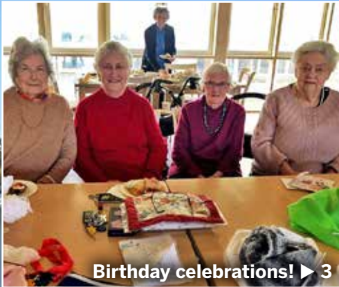
Birthday celebrations! ▶ 3